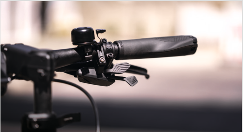
NEW 3X3 E.TR.CMD